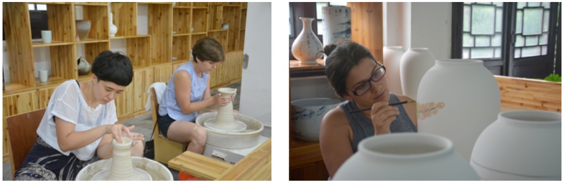
Ceramics Making and Glazing

Chinese enjoys a long history of ceramic making. The workshop will take place in one of China's oldest ceramics factory in Gaochun, a city 200 km away from Wuxi. During the workshop, students will get to know the history and art as well as the production process of ceramics at the field and also enjoy the design and hand-making: drawing, glazing and sintering of the pottery, getting a real taste of the traditional Chinese art and ceramic crafts.